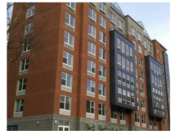
NYC Multifamily High-Rise Arbor House

In 2010, NY Passive House (NYPH), a non-profit organization, was formed to promote a healthy, comfortable, and energy-efficient built environment through the promotion of the Passive House building standard. To this end, NYPH will be holding its third annual PH Symposium in NYC on June 17th with a focus on the big buildings we use and occupy every day in an urban setting. No longer the exclusive bastion of single home “first adopter” pioneers, PH is now focusing on apartment buildings, schools, shops, and office buildings.