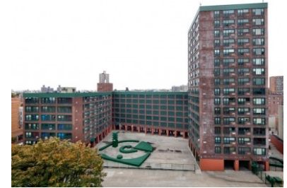
Twin Parks — Bronx, NY

In the summer of 2011, SWA worked with real estate developer, Omni New York, to significantly reduce energy consumption in the Twin Parks, master-metered electrically heated complex. Located in Bronx, NY, Twin Parks had 100% occupancy and a population of low-income tenants occupying its 274 units. One of the main challenges was to implement major changes with little disruption to the community. Omni New York, Renewal Construction, and SWA approached the project from the inside out, beginning with large system upgrades, such as the replacement of electric heating with a hydronic distribution system, variable frequency drives for heating circulation pumps, an energy management system, and revamping the ventilation system. After the completion of core retrofits, the envelope of the entire building was reinforced with air-sealing, compartmentalization, and installation of double-pane windows.