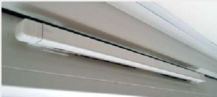
Trickle vent \approx 4 in. 2